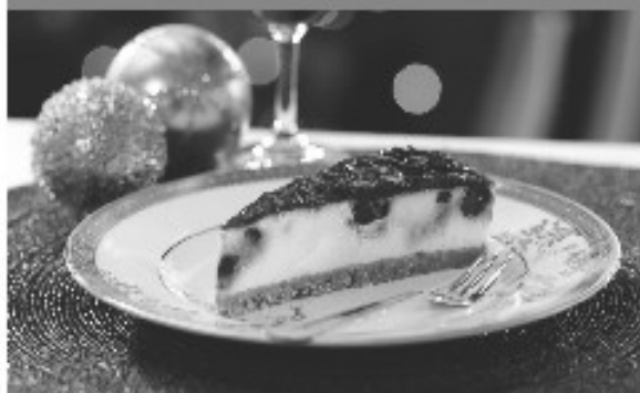
Cranberry & Port Cheesecake £1.80